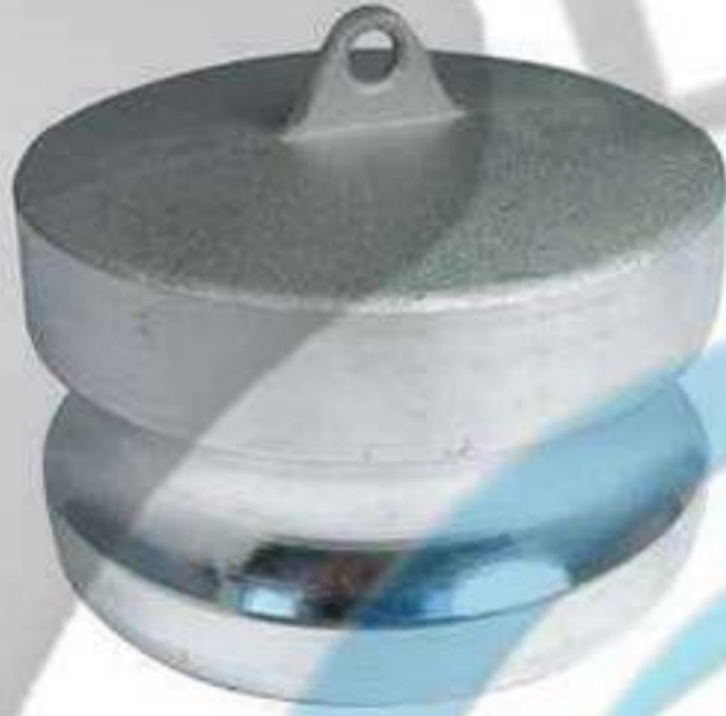
Aluminum Part DP