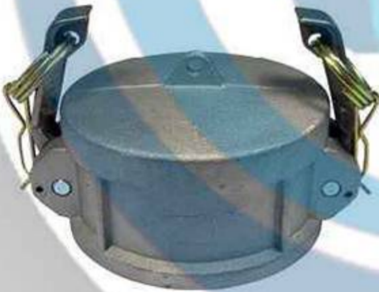
Aluminum Part DC