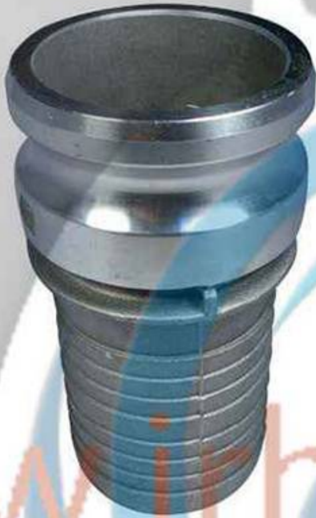
Aluminum Part E